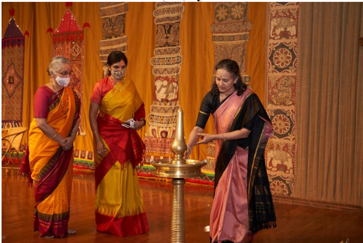
Inauguration by Chief Guest