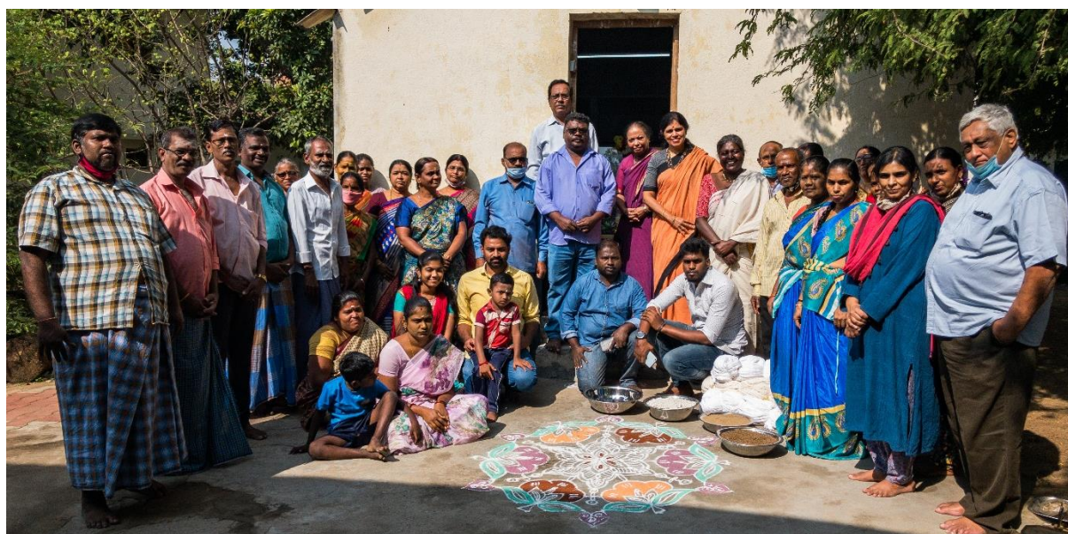
Indigo vats were successfully inaugurated on 15.02.2021 at CERC.