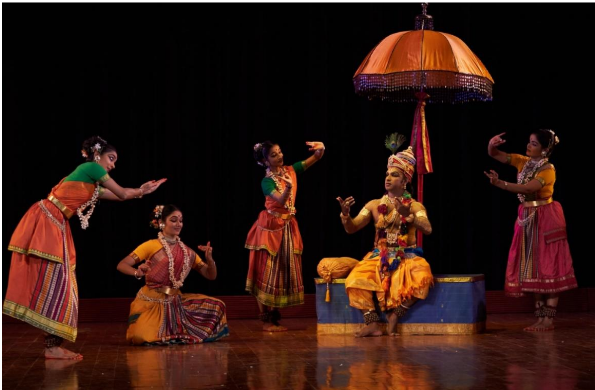
'Rukmini Kalyanam' Dance Drama by Kalakshetra Foundation