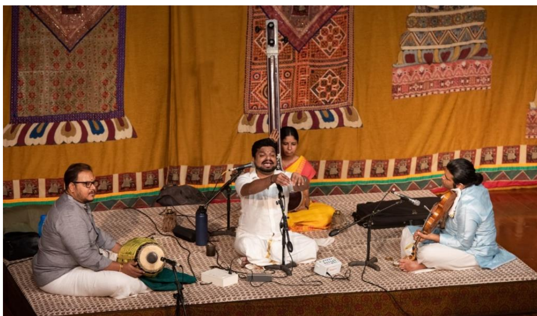
On 2 nd February - Carnatic Vocal by Kunnakudi Shri M.Balamurali Krishna.