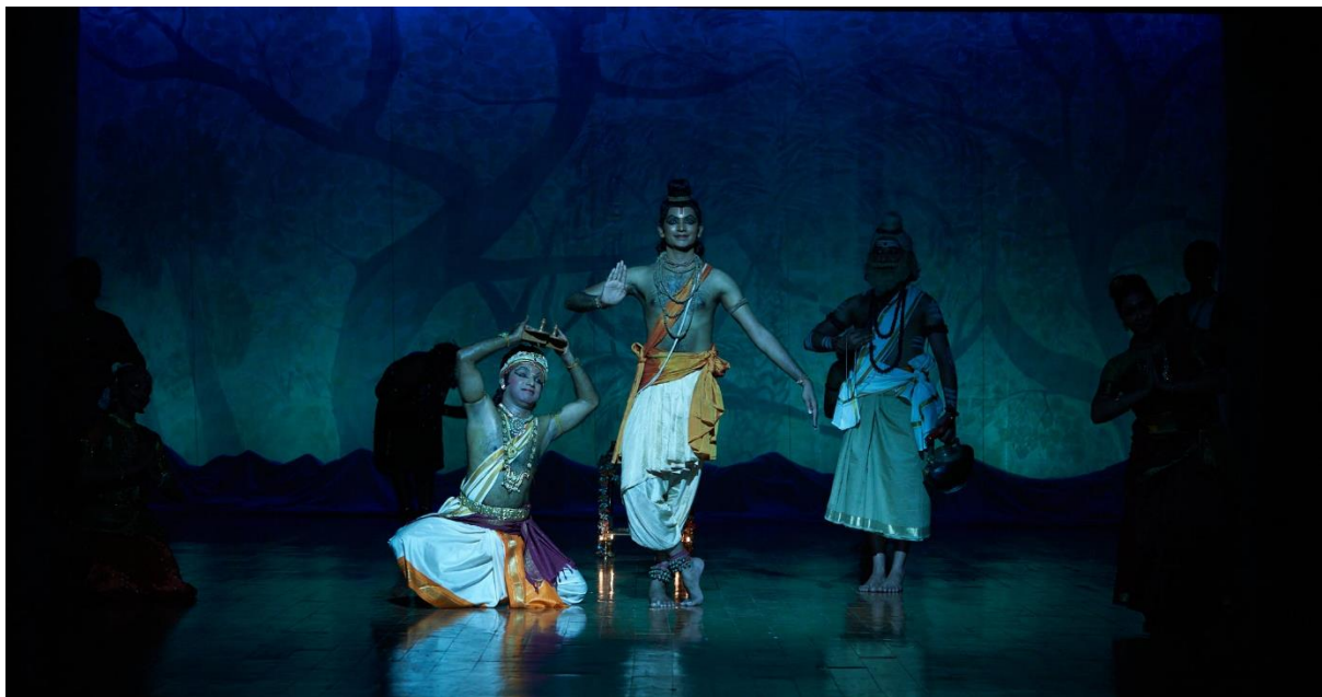
'Paduka Pattabishekam' Dance Drama by Kalakshetra Foundation