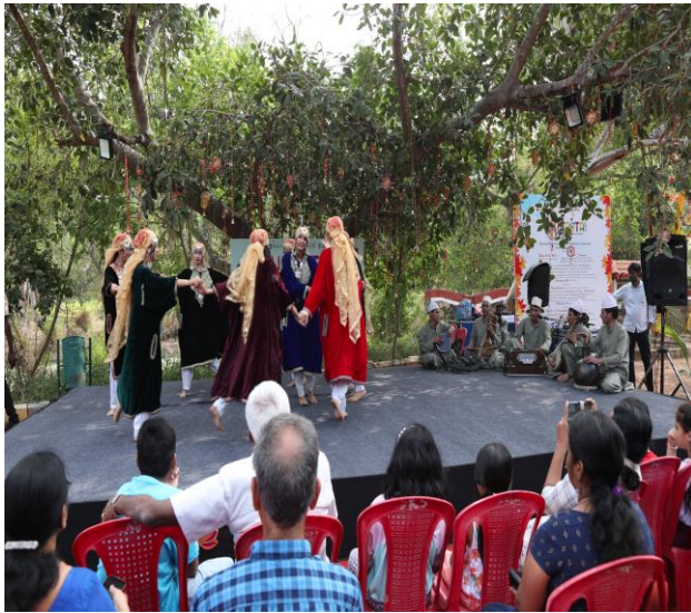
Kashmiri Folk dance and music