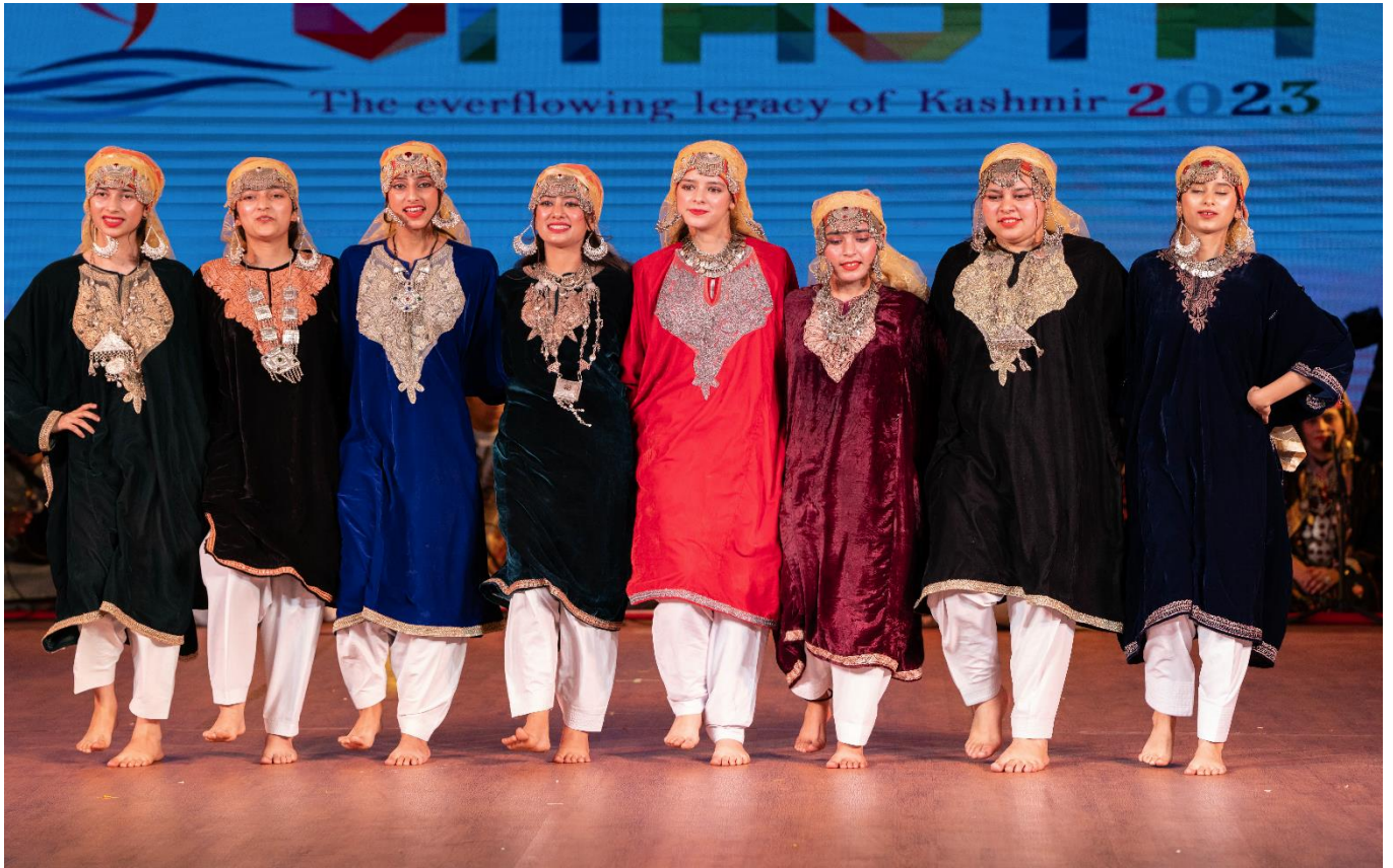
28 th January 2023 - 'Literary & Cultural Heritage of Kashmir'