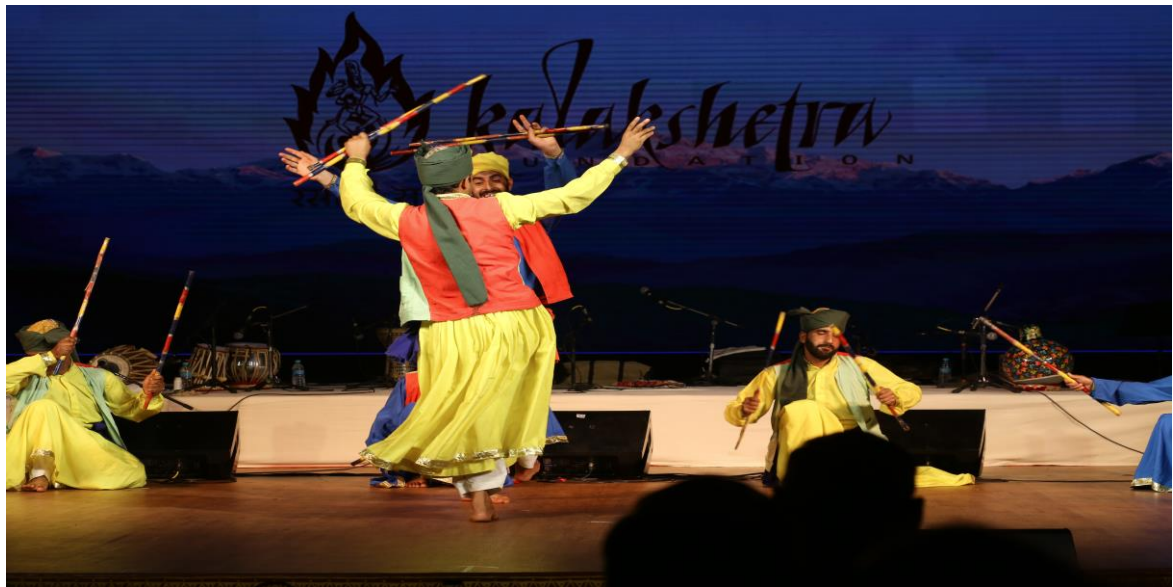
Kashmiri Folk dance and music