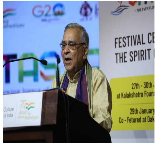
'Lalleswari - the daughter of Vitasta' by Shri. Virendra Qazi