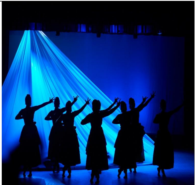
Dance presentation by Kalakshetra Foundation - Sharadha Stotram and Vitasta Sthuthi.