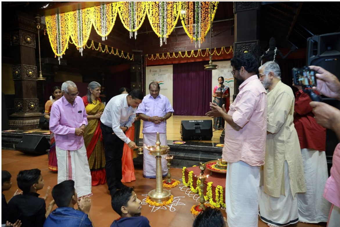
Valedictory of Margazhi Mahotsavam