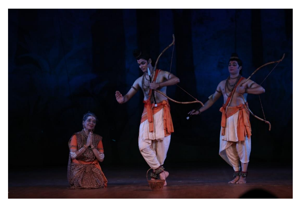
'Sabari Moksham' Dance Drama by Kalakshetra Foundation