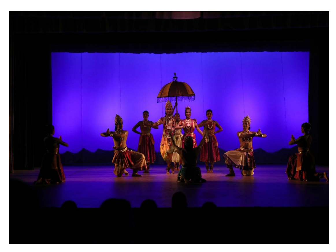
'Koorma Avatharam' Dance Drama by Kalakshetra Foundation